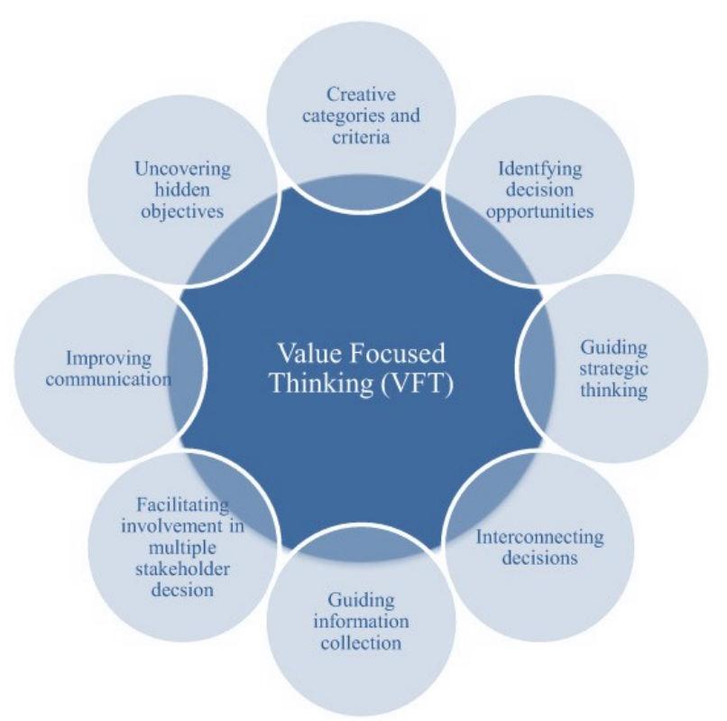
Figure 2. Value-Focused thinking process and elements

In the realm of soft OR, which uses elements of OR modeling to facilitate decision-making without necessarily arriving at a detailed formal solution, VFT plays a crucial role. It simplifies the formal OR methods to adapt to the dynamics of group and organizational processes, often culminating in qualitative decision-making by stakeholders. This approach is particularly effective in decision conferencing contexts, where VFT can be seamlessly integrated with decision analysis models to foster group interactions and facilitate consensus-building. By bridging problem structuring and decision analysis, VFT helps clarify and prioritize values and objectives within organizational processes and generates and evaluates strategic alternatives, making it a versatile tool in both structured decision analysis and broader soft OR applications.VFT application in this research