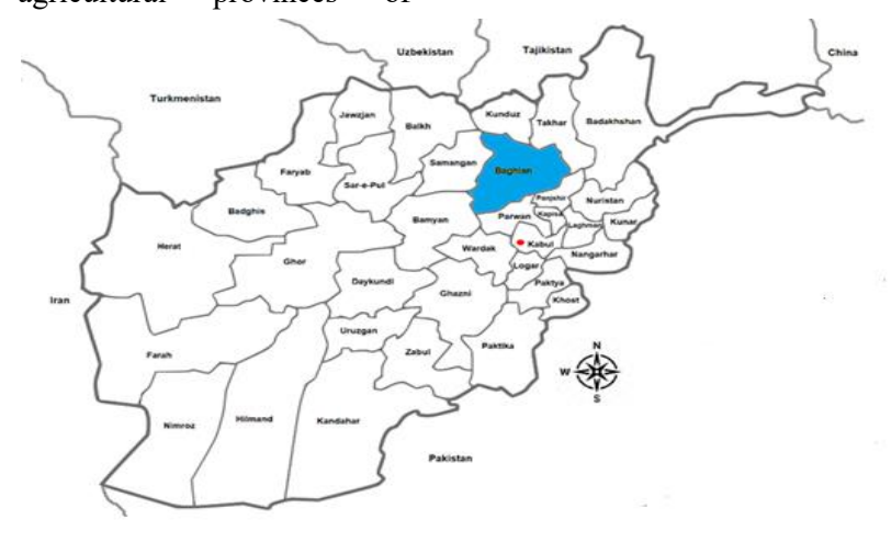
Figure 1. Map of Afghanistan and the study area

Afghanistan. Baghlan is located 230 km from Kabul along the Kabul-Mazar-e-Sharif highway. This province is a part of the northeastern provinces and connects eight Northern provinces of the country with the capital of Afghanistan (Kabul). The main agricultural products of this province are wheat, rice, melons, turnips, cotton, potatoes and onions. The area of this province is 21112 km². The population of Baghlan Province is about 1,053,200 people (NSIA and Profile of Baghlan Province, 2019).