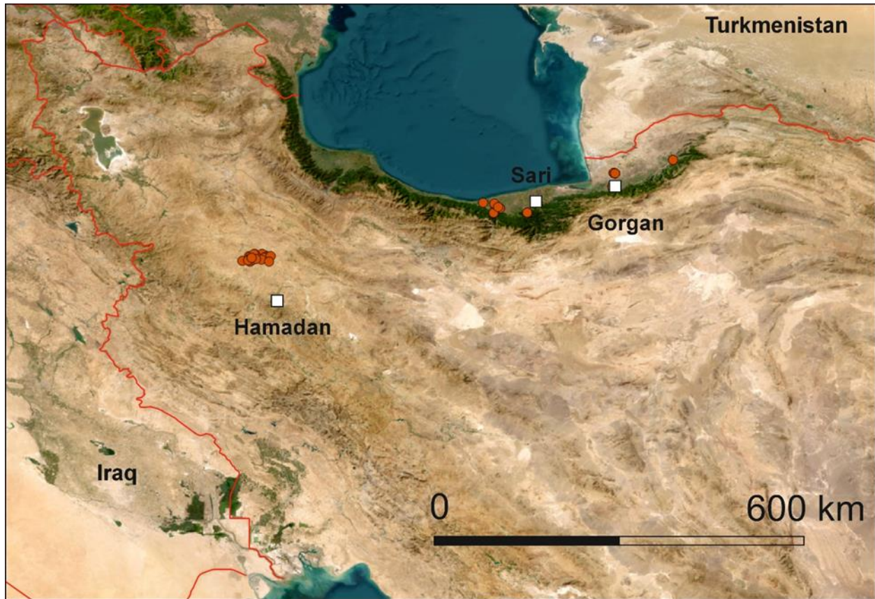
FIGURE 1. Geographical area of study.