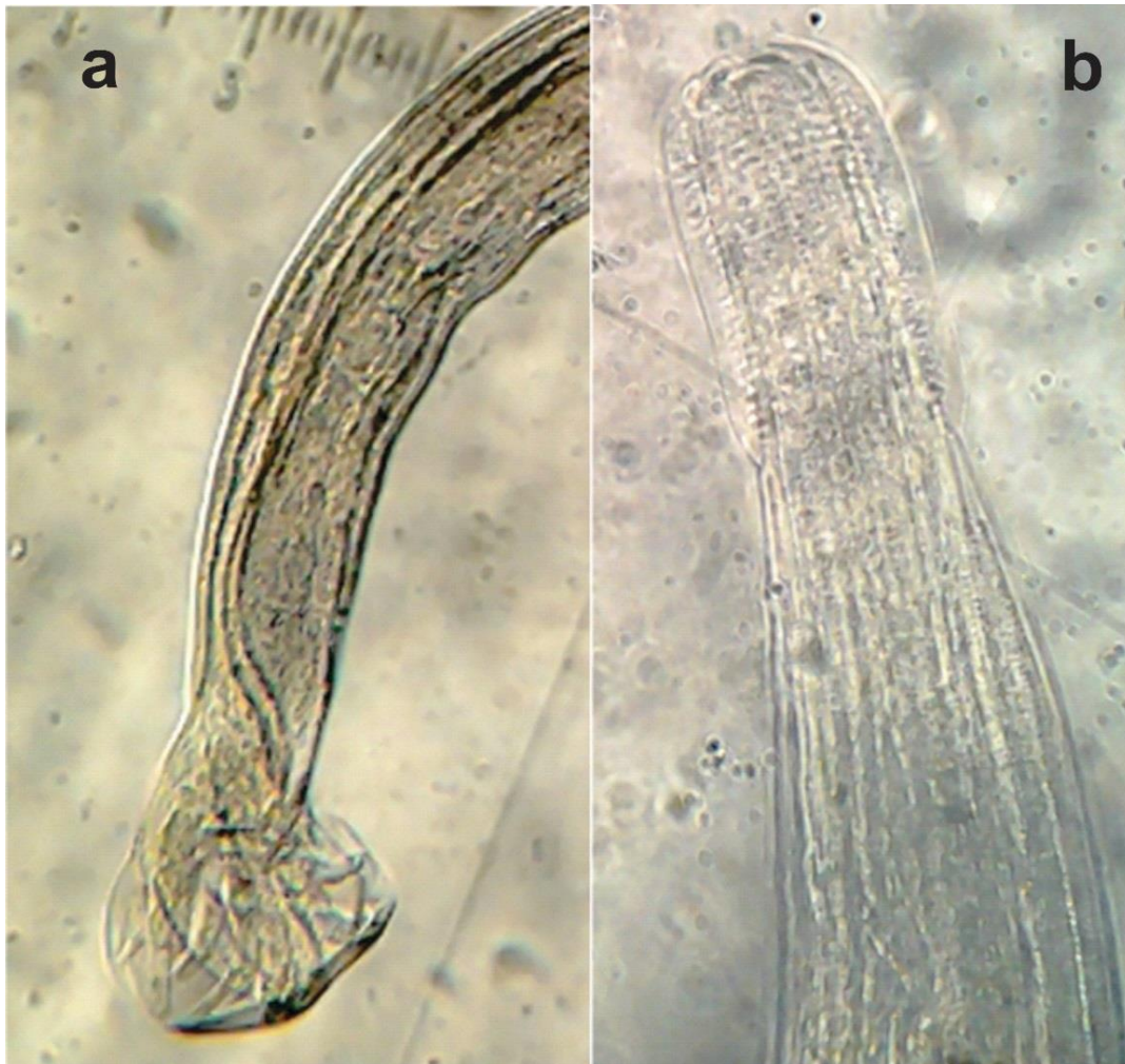
FIGURE 3. Heligmonoides taiwanensis isolated from M. vinogradovi in Hamadan Province, Iran. a) posterior end of an adult male. b) anterior end of an adult male.