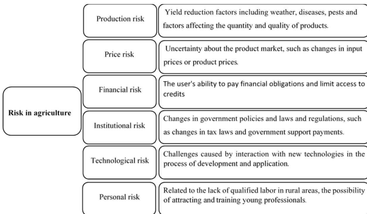
Figure 1- Classification of sources of risk in the agricultural sector

Farmers are often compelled to make decisions regarding resource allocation and crop production in environments where risks related to prices and crop yields prevail. The numerous risks inherent in the agricultural sector can significantly influence cropping patterns and the composition of cultivated crops ( Wang et al., 2022 ). The intrinsic nature of risk entails adverse outcomes such as reduced returns and income, which, in severe cases, may lead to crises like financial bankruptcy, food insecurity, and health-related challenges ( Komarek et al., 2020 ).