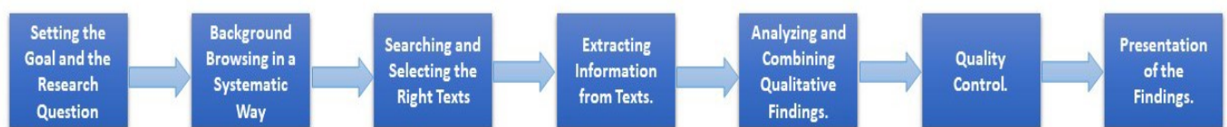
Figure 1. Successive steps of the meta-synthesis method (Ludvigsen et al., 2016)

Meta-synthesis is a type of qualitative study that examines information and findings extracted from other qualitative studies related to the subject and provides a systematic approach for researchers to explore new topics. Therefore, meta-synthesis is an exploratory research method for creating and extracting a common reference framework for previous studies' results that combines separate qualitative research projects by translation and synthesis processes at an abstract level. In other words, meta-synthesis is the process of searching, evaluating, combining, and interpreting qualitative studies in specific contexts (Ludvigsen et al., 2016). The most common method of meta-synthesis is the seven-stage model of Sandelowski and Barroso (Sandelowski et al., 2007), which is used in this research (Fig. 1). The research findings are presented here based on the steps of the meta-synthesis method.