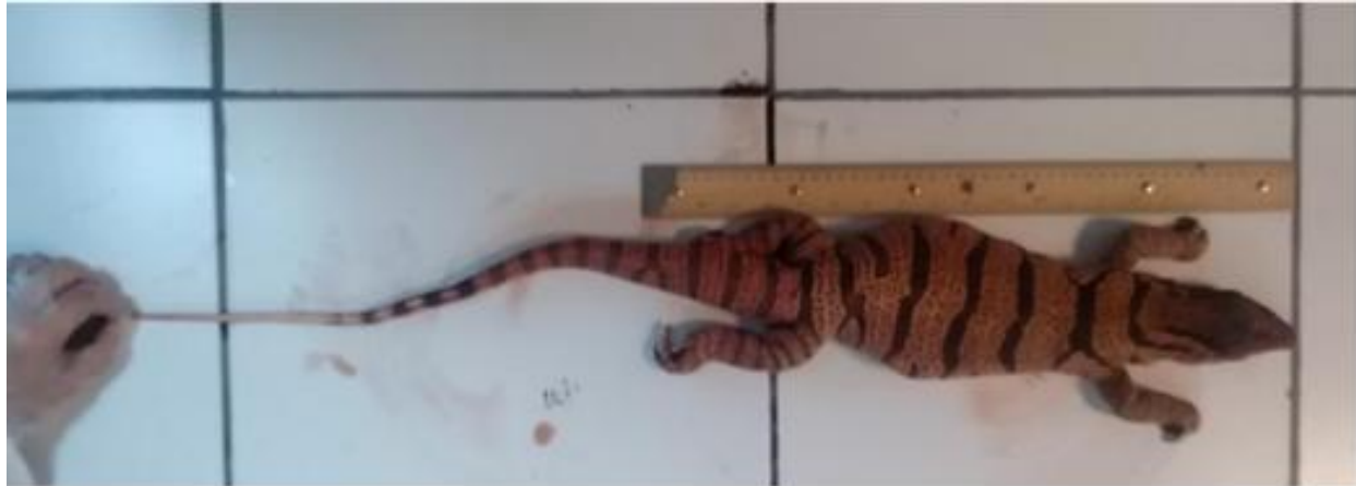
FIGURE 4. Varanus caspius . The Zoological Museum specimen of Razi University has been used for photographing.