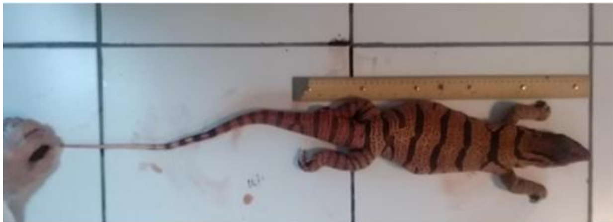
FIGURE 4. Varanus caspius . The Zoological Museum specimen of Razi University has been used for photographing.