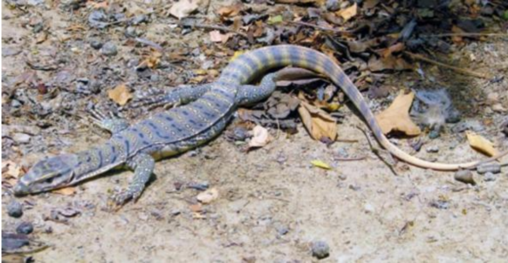
Figure 5. Photograph of a juvenile Bengal monitor lizard ( Varanus bengalensis ) captured in Bahu Kalat (Gandu) Protected Area (Oraie et al., 2024).