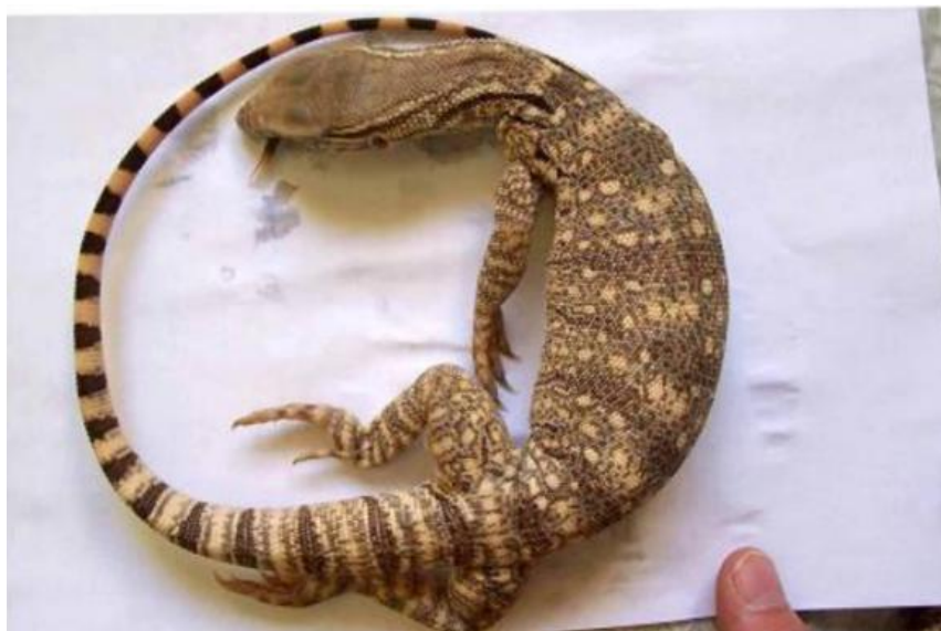
FIGURE 3. Varanus griseus . The sample was found in the south of Dehloran city, Ilam province (Fathnia et al., 2009).