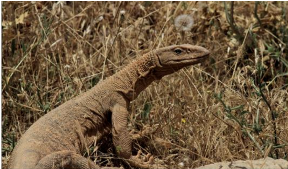
FIGURE 6. Varanus nesterovi in its natural environment at Mortka, Darbandikhan, Iraq (Böhme et al., 2023).

some lizards are a distinguishing feature between species) is true to some extent for the mentioned species; The similarity in the structure of the skull indicates a close relationship between the two species and their similar feeding method (Ghanbarinia et al., 2019). The documented localities of Varanus nesterovi form a distribution range that appears to be wedged between the respective ranges of V. g. griseus and V. g. caspius . As far as known, it is confined to the western and southwestern margin of the Zagros Mountain range on both sides of the Iraqi-Iranian border, extending down to the area of Shiraz, Fars Province, Iran. It seems that V. nesterovi prefers more elevated habitats, having been recorded from 600 to 1100 m (Fig. 5; Böhme, 2015). V. nesterovi is an endemic inhabitant of the southwestern Zagros Mountain range (Fig. 7). Its distribution area in submontane to montane steppe habitats is wedged between those of its two much more widespread relatives: V. griseus in the west and V. caspius in the east (Böhme et al., 2023).