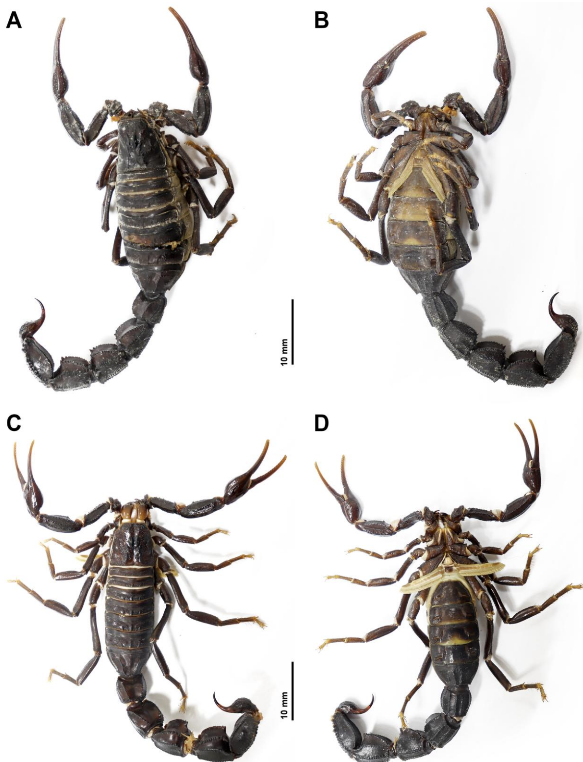
FIGURE 1. Adult specimens of Androctonus kunti Yağmur, 2023 collected from northwest Iran, female: A) dorsal view, B) ventral view; male: C) dorsal view, D) ventral view.