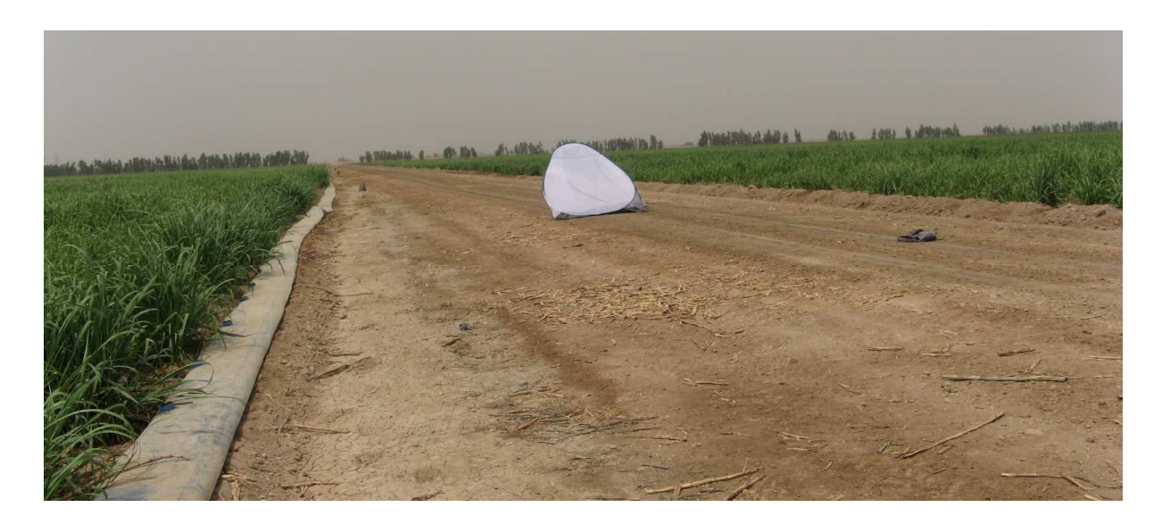
FIGURE 3. Sampling site of Hadula vassilinini in sugarcane fields of south-west Iran (the Khuzestan Province). Cropland weeds occur in this habitat may act as host plant for this noctuid species. The white tent, as a light trap, was set up for night sampling.