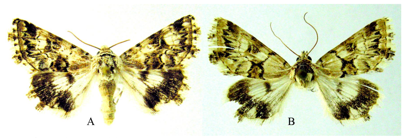
FIGURE 1. Armada nilotica adults. A. male, Iran, Kerman prov.; B. female, Iran, Kerman prov.

Distribution in Iran: Kerman (new record from Iran).