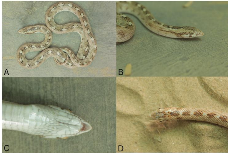
FIGURE 2. (A) Dorsal view of Lytorhynchus paradoxus , showing entire body morphological characteristics. (B) Lateral view (specimens Lp002, Lp004). (C) Ventral view of the head, highlighting the arrangement of infralabials and mental scales (specimen Lp005). (D) Dorsal view of the head, showing the prefrontal and frontal scales (specimen Lp006).

Gender identification was performed using popping and probing techniques (Creer et al., 2012; Harding & Callaghan, 2015). The probing involved gently inserting a sanitized and lubricated probe into the cloaca, directed towards the tail tip, to check for hemipenes in males (Lambert et al., 2009; Halliday & Adler, 2012). The popping or manual eversion technique involved applying firm but gentle pressure to the ventral side of the tail, approximately three-quarters of the way from the cloaca to the tip, and then sliding the thumb towards the cloaca (Buchan et al., 2005; Marshall et al., 2018). This method can cause the hemipenes to evert in males, appearing as two reddish structures, whereas in females, no such structures emerge (Aldridge & Brown, 1995; Hayes et al., 2009). While the popping method is generally considered less safe due to the potential for injury, it is effective when performed by professionals who carefully handle the technique.