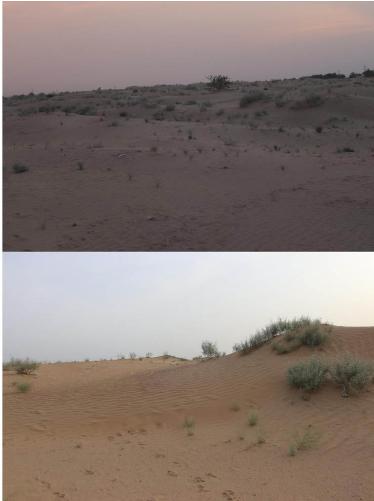
FIGURE 4. Landscape view of study area, showing the habitat features of Lytorhynchus paradoxus .