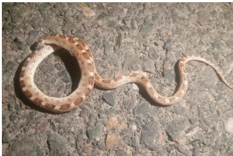
FIGURE 5. Killed specimen of Lytorhynchus paradoxus (specimen Lp007) from Vehari.